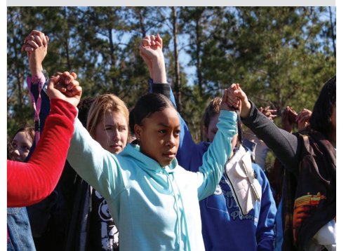
The student body stands together to show support.

Thank you for your work.