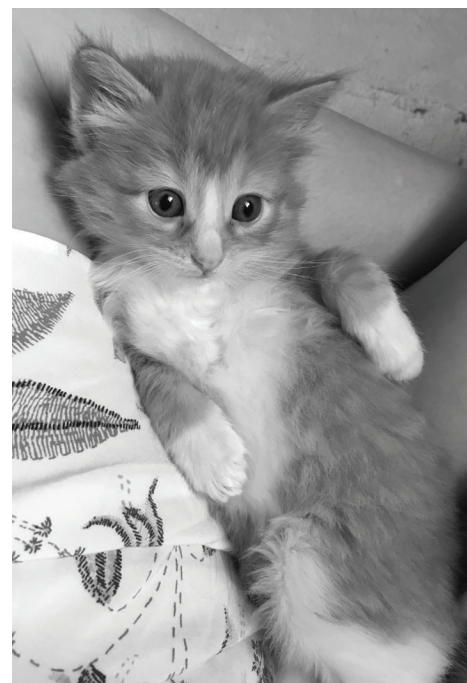
The adoptive parents named this sweet kitten Philly Boy.

temporary home with love, food, water, and a litter box. Because I was fostered, I was adopted quickly.