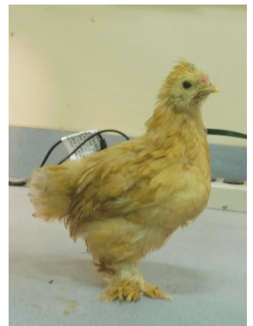
The chick is a mix breed of frizzle and naked neck chick