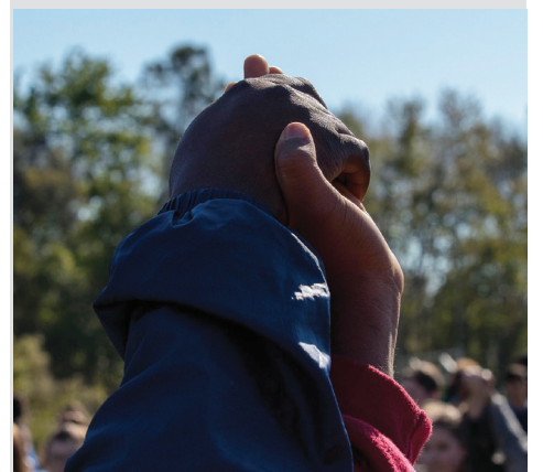
Students stand together during the walkout.

"Somewhere, something incredible is waiting to be known."-Carl Sagan, a favorite of Mr. Gregg, see page 6